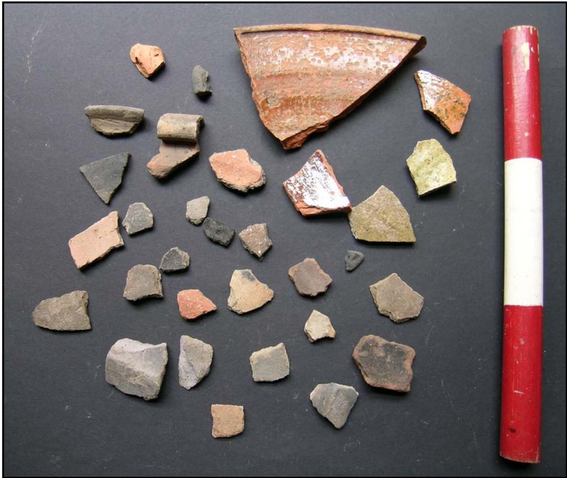
Plate 4: 12 th to 17 th Century pottery from the garden soil close to Lilac Cottage. Scale 30cm.