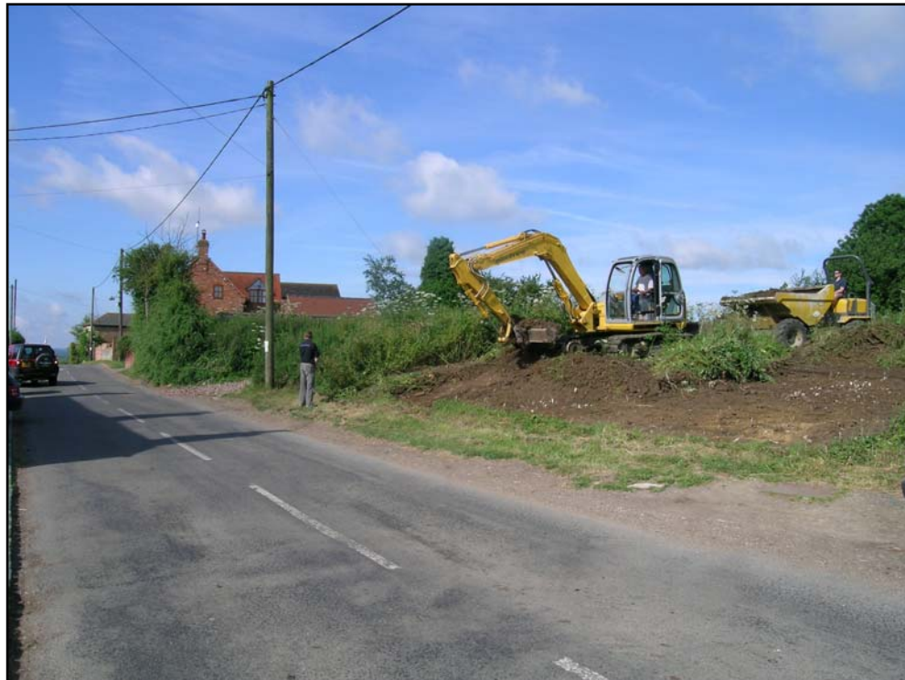
Plate 1 Site of Hampden Row Cottages, Charndon at the commencement of works