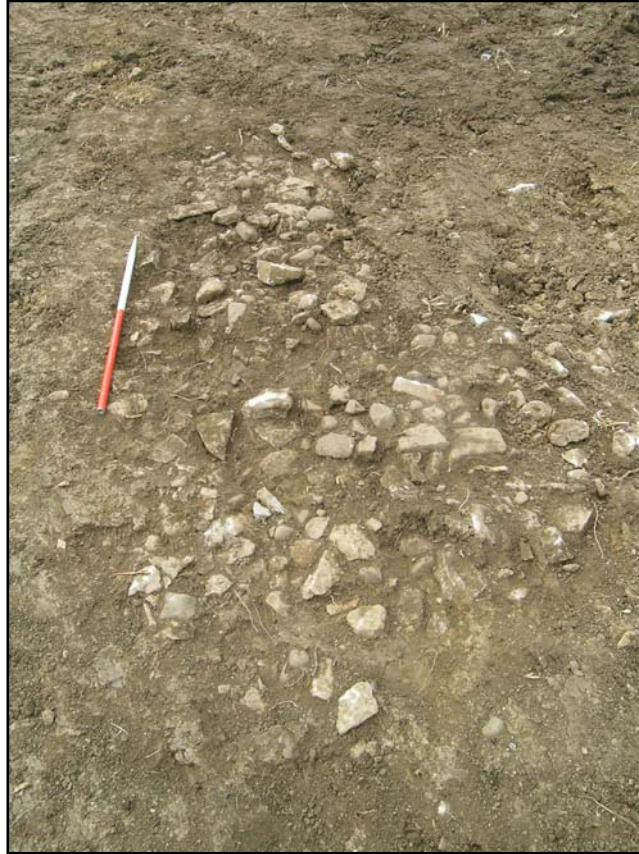
Plate 3 Truncated stone surface (002) uncovered close to Main Street.