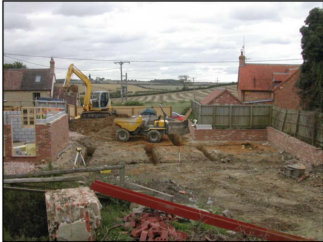
Plate 2 Looking to the east during construction work, with Lilac Cottage to the right.