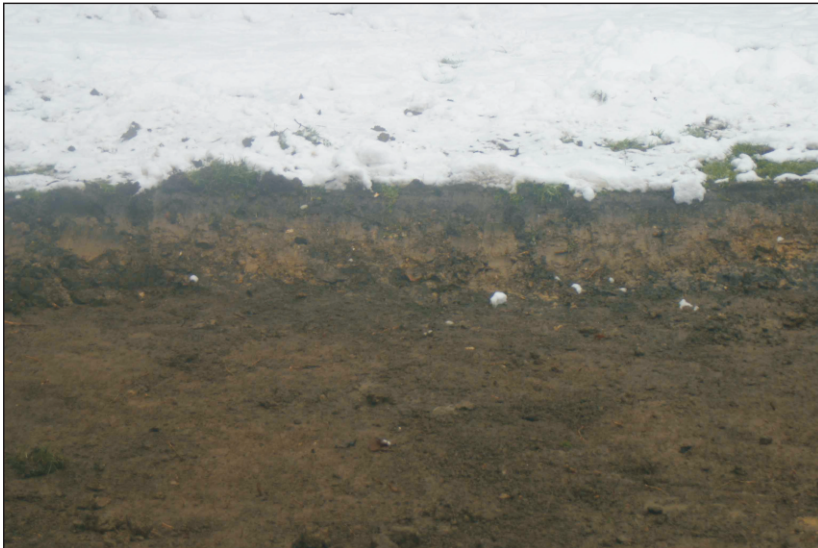
Figure 3. Clay dump (2)