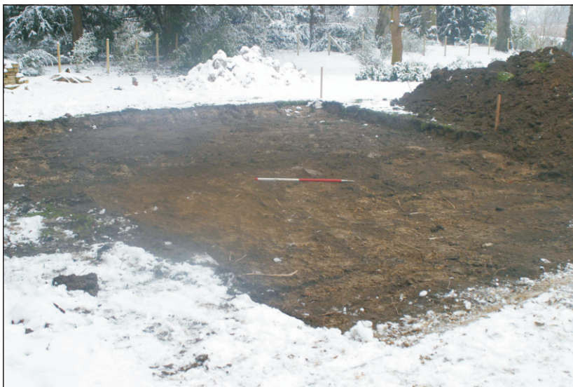
Figure 4. Barn area and access, looking northeast