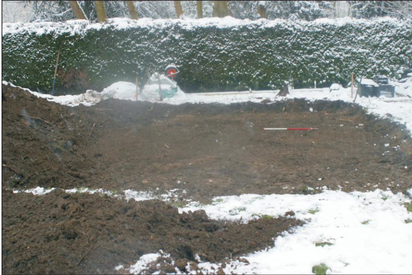
Figure 2. Barn area, looking west